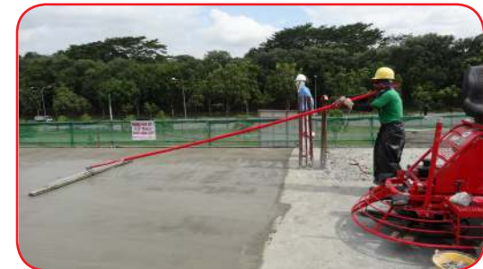
Check Rod: Reduces bumps and fills low areas while the concrete is still plastic.