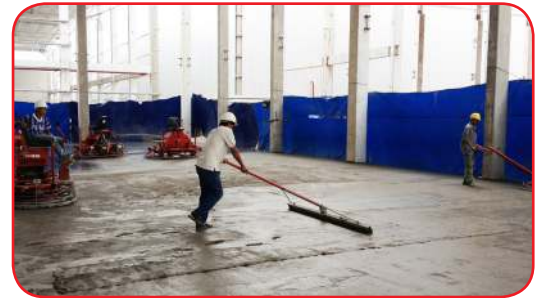
Bump Cutter: Cuts down bumps and fills low areas after concrete slab has been floated.