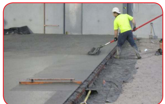
Mesh Roller: Ideal for embedding exposed aggregate and quickly levels slab and prepared it for final finish.