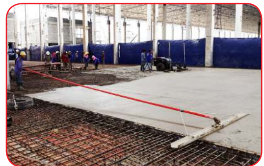
Channel Float: Use in lieu of traditional bull float for flatter floors and pavements.