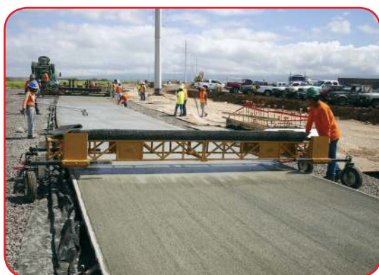
Paving Wheel Attachment Option