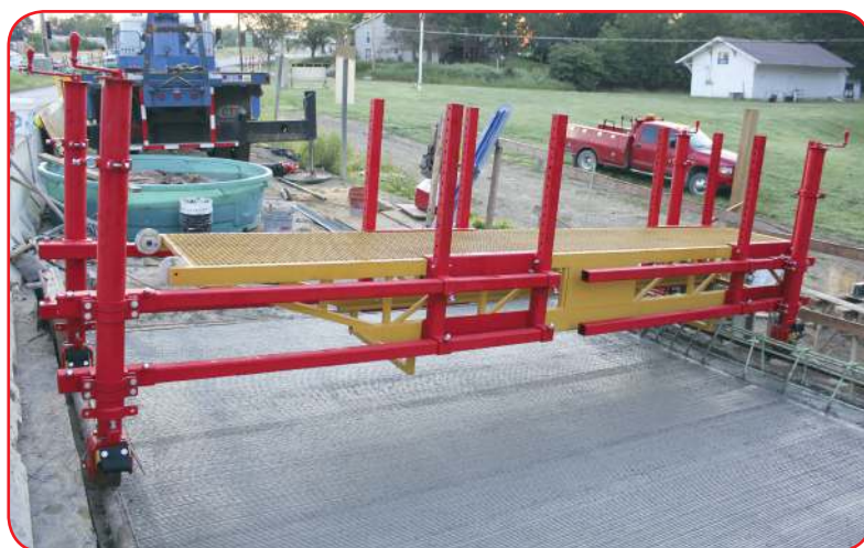
Bridge Deck Wheel Attachment Option