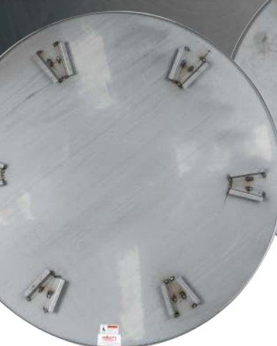
Safety Catch Pan Shown

Allen offers both Flat (0mm to 3.18mm dish) and Mild-Dished (6.35mm to 9.53mm dish) steel pans made from USA Steel for greater durability. This gives contractors even more pan choices from Allen.