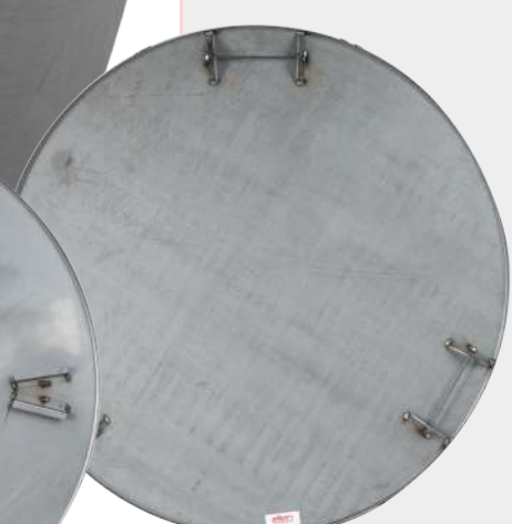
Clip-On Pan Shown