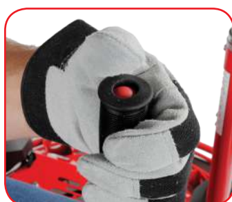
Fingertip Activated Spray System for controlling touch ups.