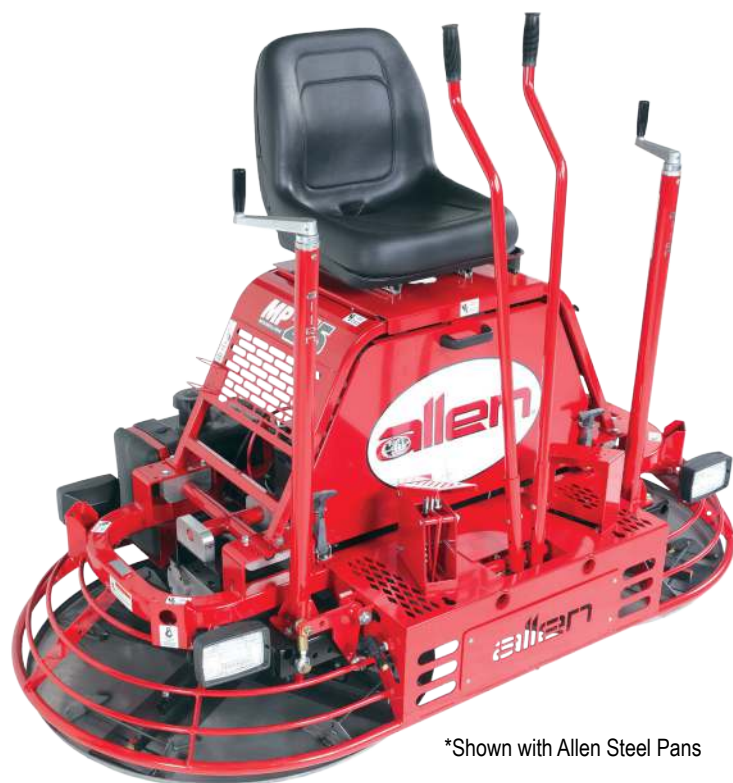
*Shown with Allen Steel Pans

The MP215 represents the entry-level rider complete with features found on Allen's larger riders and the renowned durability of all Allen Equipment. The MP215 is equipped with the Honda GX690 gasoline engine, heavy duty drivetrains all pack in easy to service frames. The MP215 has the standard-duty gearboxes with the four-bladed rotors. The MP215 is perfect for tight spots and smaller jobs.