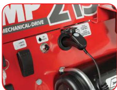
Easy To Access Switches and even includes 12V charging plug for phones or electronic devices.