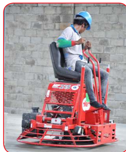
MP215 on the job