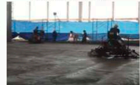
Allen MSP 445 With Pans