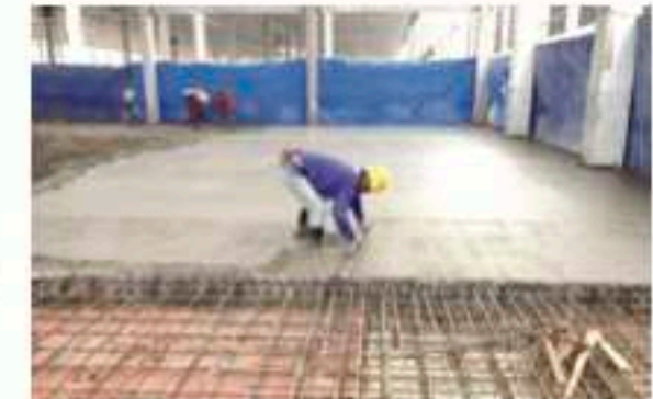
Hand Tools For Edges