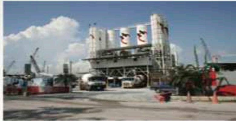
Quality Concrete Supply