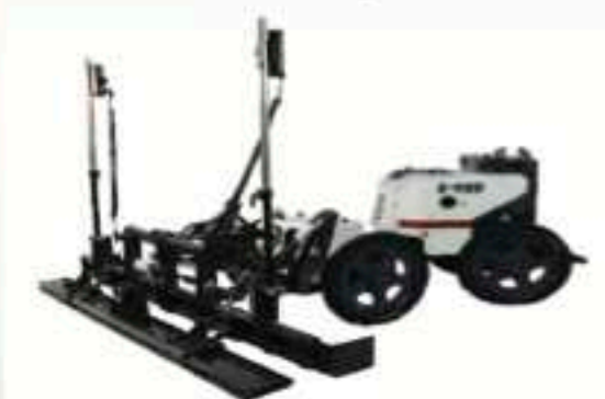
Somero S485 Laser Screed