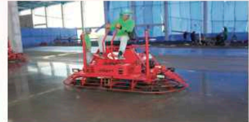
Allen MSP 445 With Blades

Concrete Mix Flatness F. Numbers Formwork Screeding Measurement